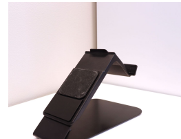
Assembled mobile stand