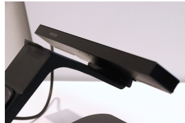
✗ Eye tracker mounted incorrect