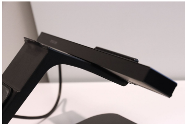
✓ Eye tracker mounted correct