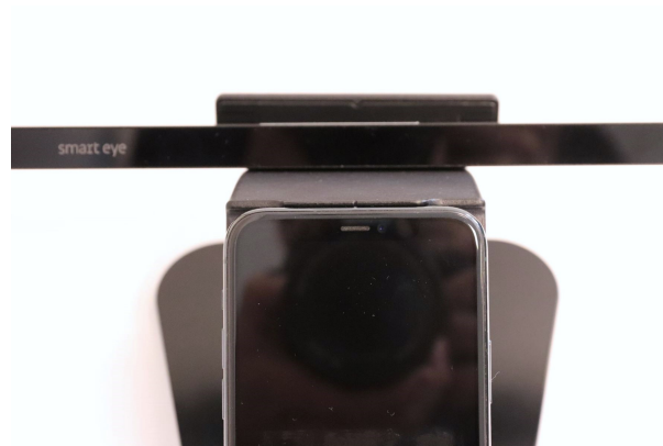
Phone centered and touching the top